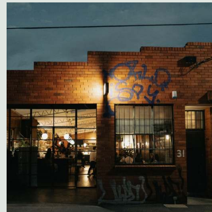
Lilac Wine Available for group bookings and exclusive booking for Tuesday-Thursday, Saturday-Sunday