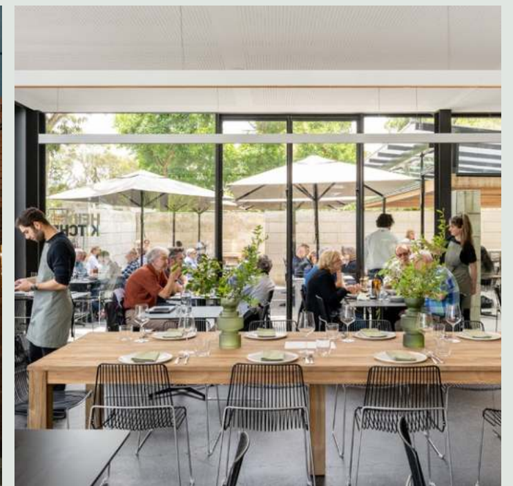
Heide Kitchen and Sidney Myer Education Centre Available for exclusive hire for workshops, private events and weddings